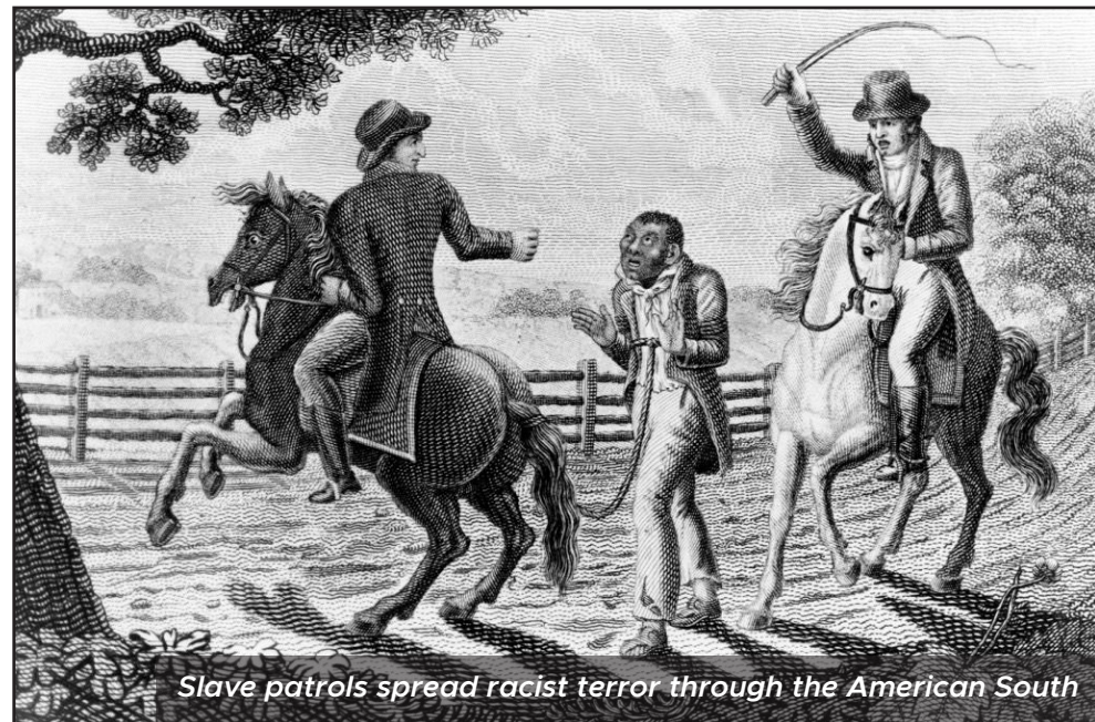
Slave patrols spread racist terror through the American South

“Slave patrols had full power and authority to enter any plantation and break open Negro houses or other places when slaves were suspected of keeping arms; to punish runaways or slaves found outside their plantations without a pass; to whip any slave who should affront or abuse them in the execution of their duties; and to apprehend and take any slave suspected of stealing or other criminal offense, and bring him to the nearest magistrate.” 2